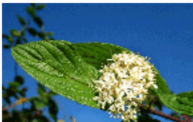
Cornus sericea

Red twig dogwood is a riparian shrub throughout our chapter area. It is a spreading shrub, to 15 ft tall, with a broad rounded habit, forming large expanding thickets. Flowers are in 2-3 inch clusters and form that attract from the im- the leaves col- It is adaptable sun or shade creek, it needs regular wa- ful bordering streambanks.