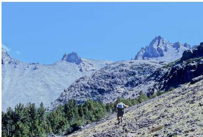
Hiking up Diller Canyon