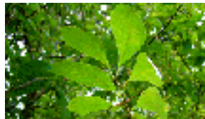
Oemleria cerasiformis

Photos and infor- other plants is on Bray has prepared will be selling at the Plant Fair for