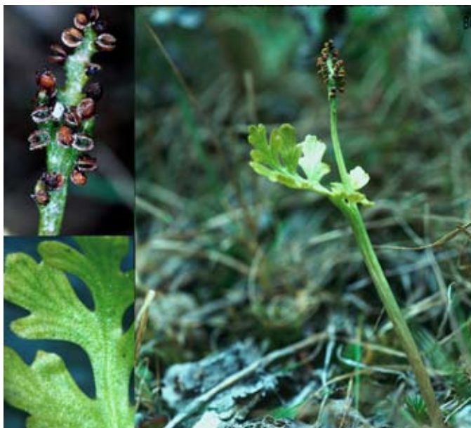
Botrychium pinnatum in forest on Mount Shasta, 1997